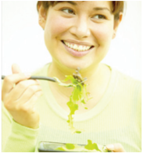
Cruciferous veggies help ward off disease.

Thinly slice Brussels sprouts, either in a food processor fitted with a slicing blade, or by hand. Heat a heavy, nonstick skillet. Add olive oil and butter, swirling the pan so that the butter melts. Saute sliced Brussels sprouts for 5 minutes. Add cider vinegar and grated Parmesan, stirring briefly to incorporate. Add salt and freshly ground black pepper to taste. Serves four—who will all be healthier for it!