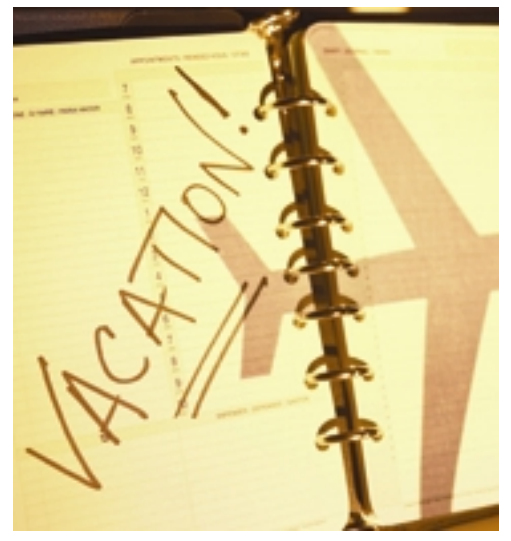
Staying healthy is key to a good vacation.

By packing a few natural remedies and paying attention to your body's needs, you'll be able to fully enjoy your trip.